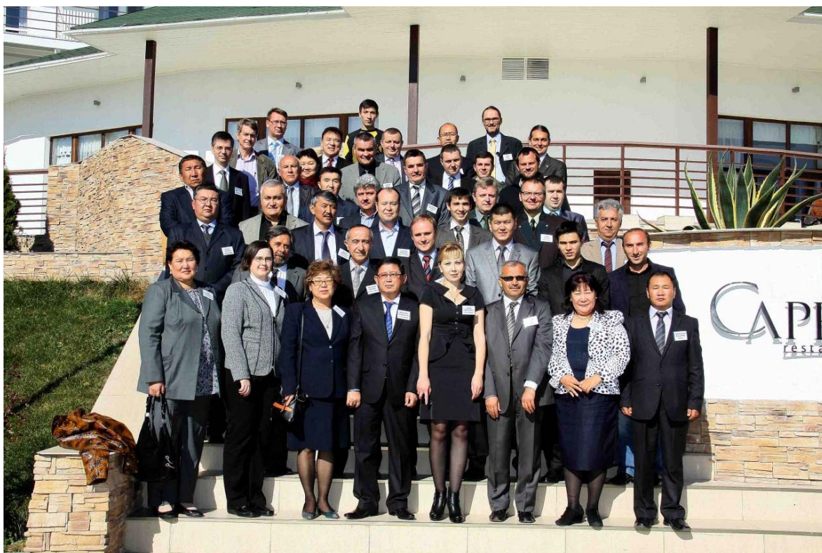
Participants of the workshop „Preparing the forest sector in Eastern Europe and Central Asia to meet global challenges”, Issyk-Kul, Kyrgyzstan, 29 October – 2 November 2012